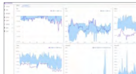
Extreme Campus Controller Expert View of RF State