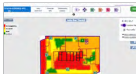
Extreme Campus Controller Wi-Fi Locationing Assessment